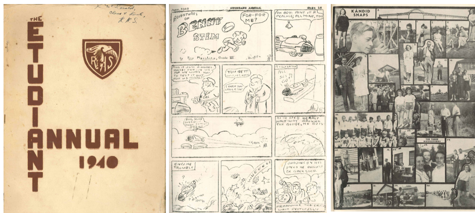
Etudiant Annual June 1940, selection of pages. Accession #2018 17.