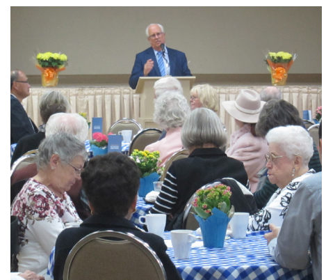
Mayor Malcolm Brodie addressing the crowd at the Archives Tea on October 12, 2018.