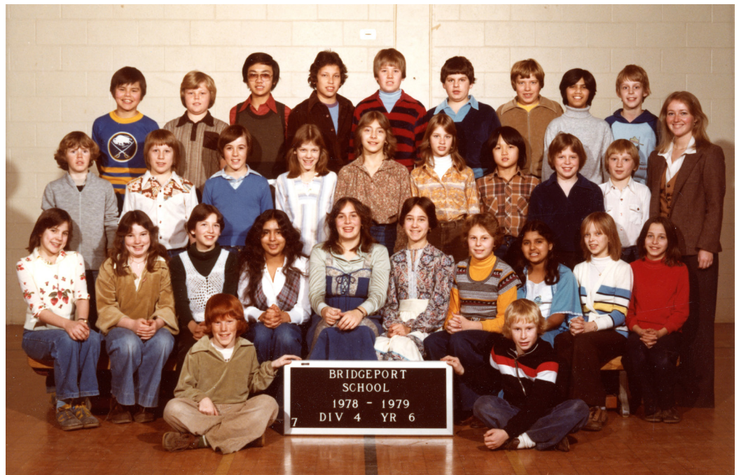
Bridgeport School class photo, 1978–1979, Div 4, Year 6.

The City of Richmond Archives has many school class photos, but our aim is to acquire every class photo of every year of every school in Richmond and we need your help to achieve this goal! If you have any school class photos that you are willing to donate to the City of Richmond Archives, please call or email the Archives at 604-247-8305 or archives@richmond.ca . The Archives accepts original photos, but we are more than happy to provide you with a high resolution scan of your photos in return for the original.