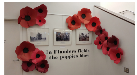
Friends of the Richmond Archives' Remembrance Day display at the Richmond Public Library, November 2018.