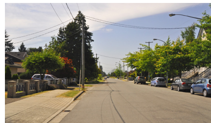
Comstock at Gilbert looking west, 2012