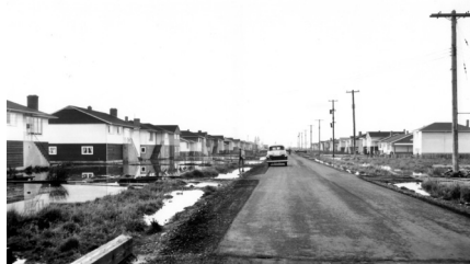
Comstock at Gilbert looking west, 1954

The new photographs provide researchers at the Archives with the ability to look back at the past to understand changes to the built environment of the municipality.