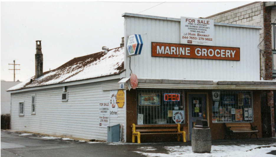
City of Richmond Photograph #2013 39 2 70 - Marine Grocery, Steveston (1996).